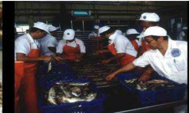
The Industry is affected which could led to increase on unemployment.