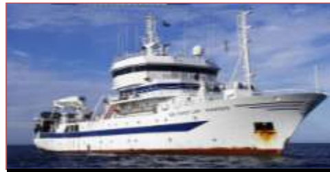
R/V Dr. Fridtjof Nansen (2011-2013)