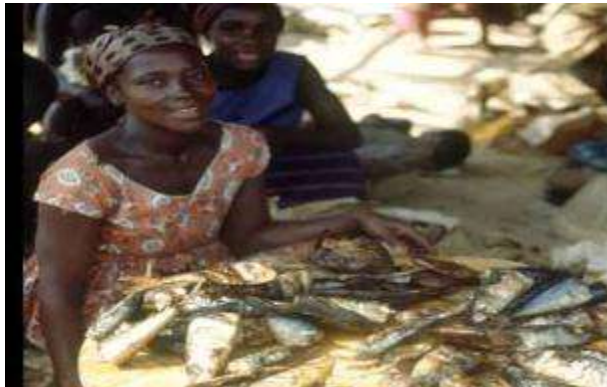
The present fisheries may not be able to improve livelihood of the fisher-folk comm.