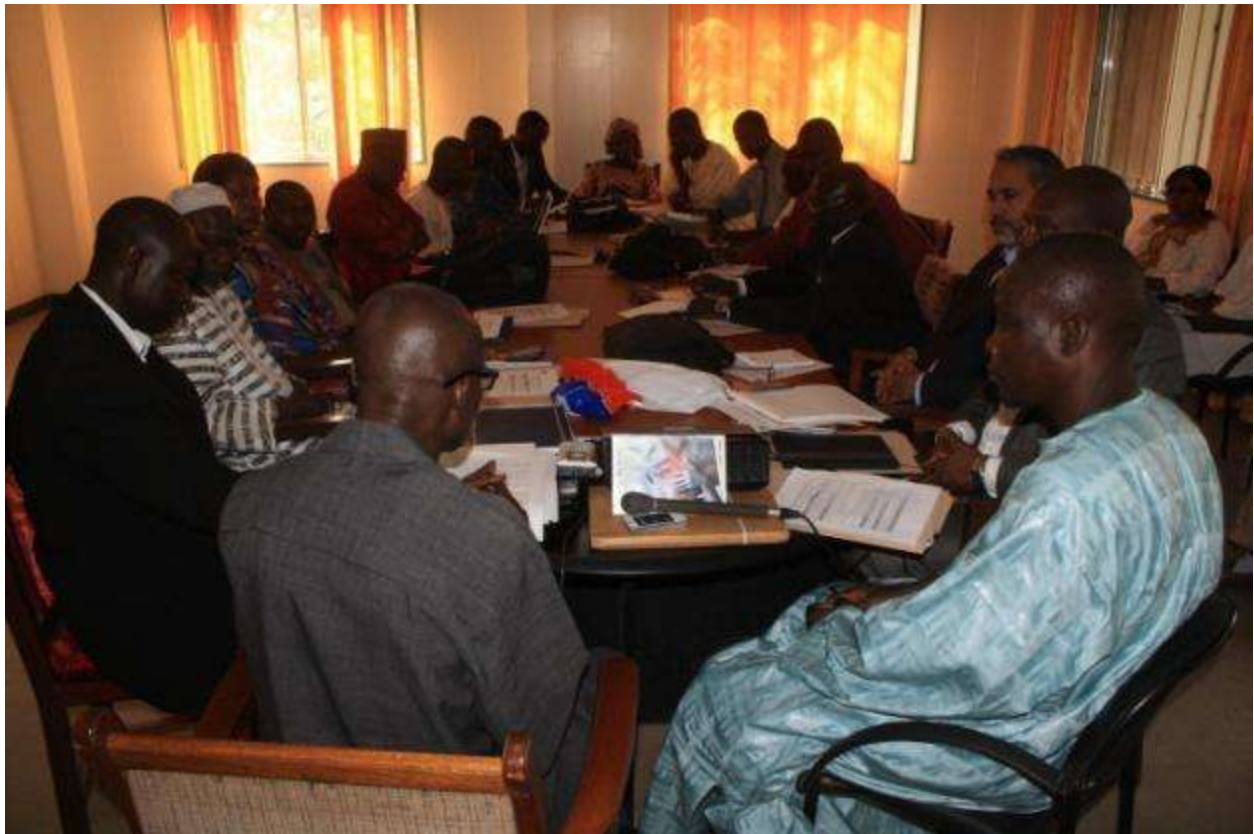
A cross-section of NIC-CCLME meeting in progress at the Fisheries Department Conference Hall, Banjul, 22 nd January, 2013. Representatives of Institutions is provided in Annex 1.

The speech was followed by introduction of participants and the Institutions they represented and followed by family photo before the 1 st coffee break.