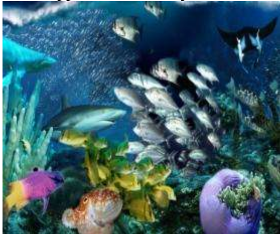
A healthy ecosystem.